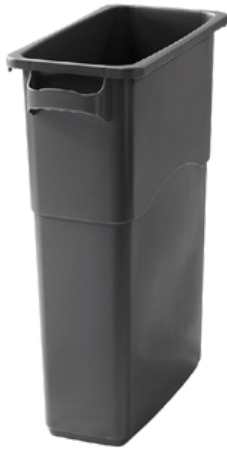
Slim bin 70l