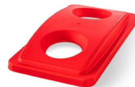
Plastic containers & cans