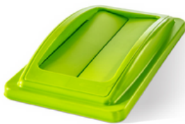
Swing Mixed Recycling lid