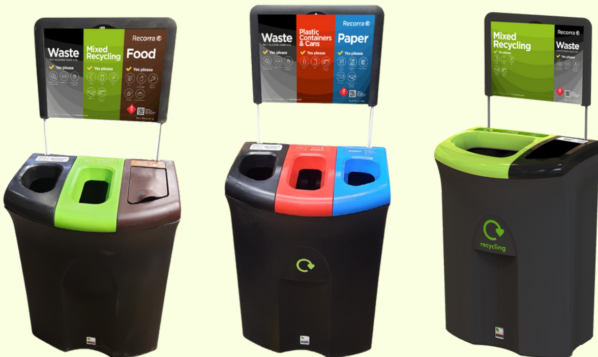
Duo split bin