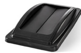
Swing waste lid